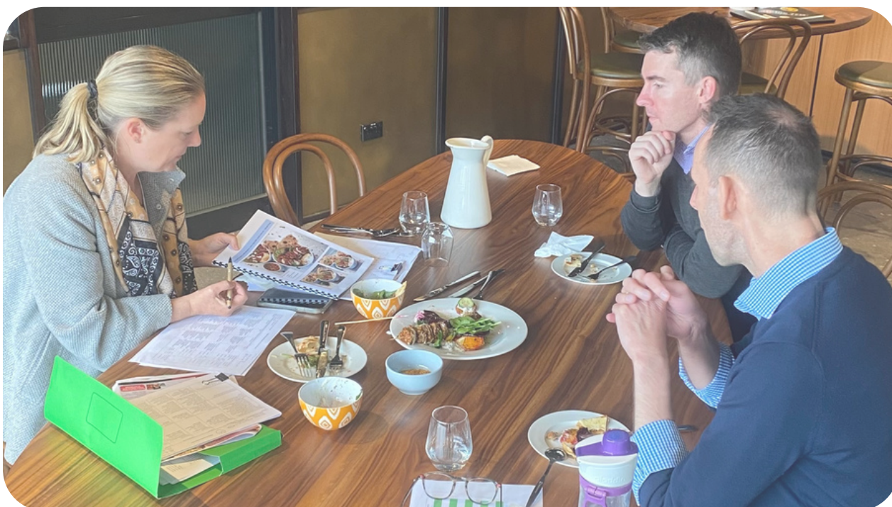
Judging at the McCormick Test Kitchen

The second stage of judging related to how the entries reflected creativity and responded to the reflection and justification requirements. The justifications and reflections were particularly well-written, genuine and really insightful, which the judges enjoyed reading in conjunction with reviewing the recipes submitted by the student teams. After a long and intensive day of deliberations, the selection of the final entries from each state and territory were made. The third and final stage of judging saw the recipes of the selected school teams from the states and territories prepared and cooked by the McCormick Test Kitchen team and then tasted by the judges. The recipes were followed according to the instructions submitted by the student teams and plated to match the photos submitted by students.